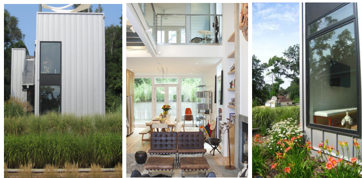
Image above: Private residence located in the River North area of Chicago. Beauty of design and construction details are key to the success of a project.

Images to left: Exterior and interior images of Church/Jett private residence featured in Dwell and winner of the AIA honor Award 2011.