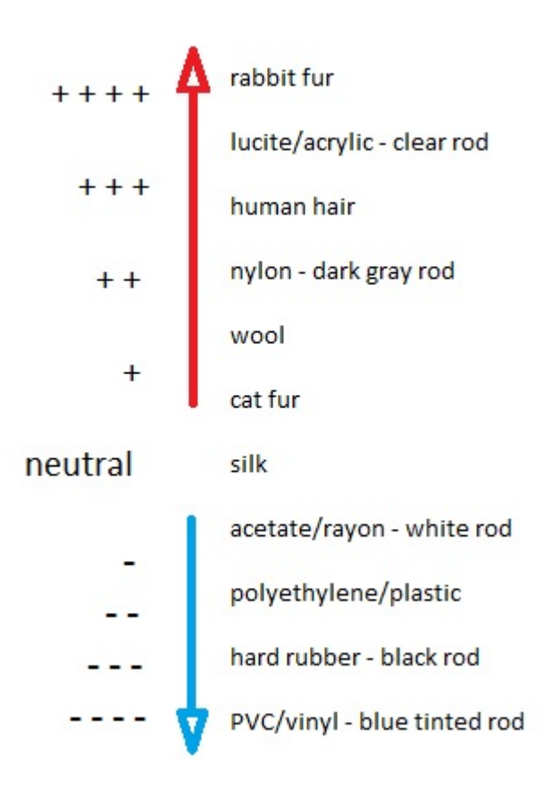
Figure 2: A relative electronegativity ranking for some common materials. Here "+" is electron donating, "-" is electron accepting. The further apart the materials, the greater the charge transferred, resulting in greater static charge.

In this lab, we will study Coulomb's law and measure the electric charge transferred from one object to another using a pith ball electroscope. A simple electroscope is a device used to measure the presence and magnitude of electric charges. The pith ball electroscope in Figure 1b, for example, shows the attraction between two charged objects - a pith ball (a light weight object that can easily be charged) and a charged rod. There are two ways to displace charges an object: conduction or induction. Charging by conduction involves direct contact while induction requires no contact. Rubbing dissimilar materials, for example, can remove or deposit electrons. This is process is referred to as triboelectricity (or frictional electricity) since the materials are charged by friction. For example, rubbing a neutral glass rod with silk "rips" charges off one of these surfaces and makes them stick to the other. Whether a material is an electron donor or accepter depends on its electronegativity. Figure 2 shows the relative electron affinities for several popular materials. The materials listed towards the positive end donate electrons while the materials towards the negative end accept electrons. If a PVC rod is rubbed with silk, the rod will acquire a negative charge. If nylon is rubbed with silk, it will acquire a positive charge.